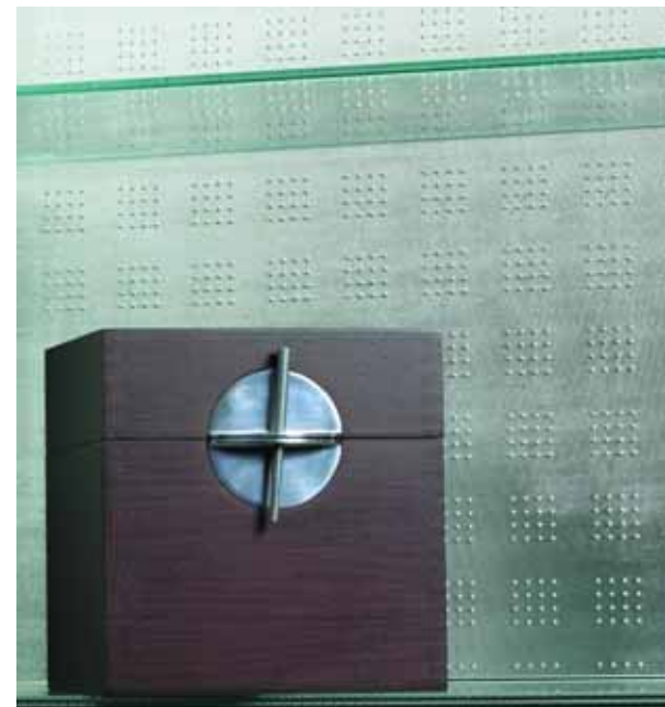
SGG MASTER-LENS CONTRAST.