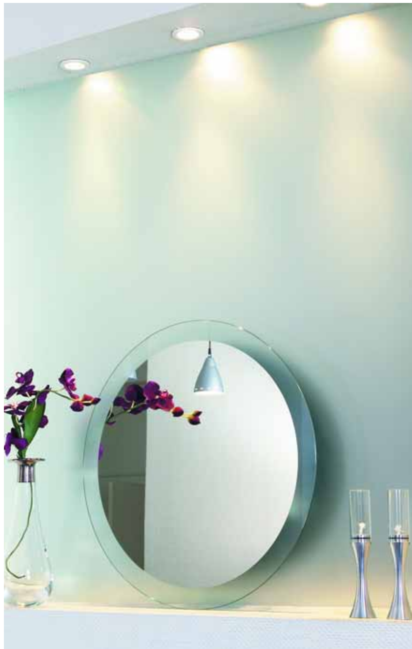
SGG SATINOVO CONTRAST.

Weight : 10 kg/m 2 for 4 mm, 15 kg/m 2 for 6 mm