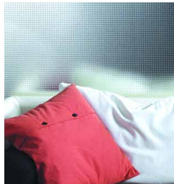
SGG MASTER-CARRE CONTRAST.

• Please contact us for other thicknesses and dimensions.