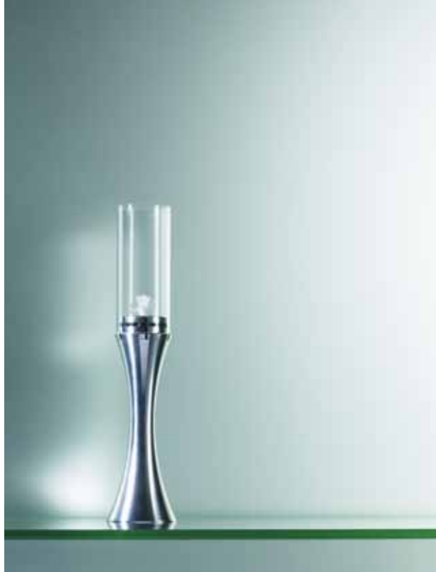
SGG SATINOVO CONTRAST.