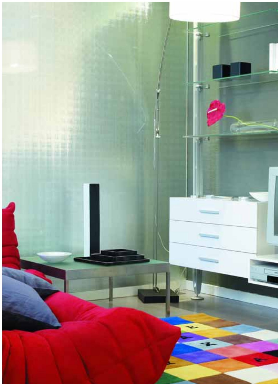
SGG MASTER-LENS CONTRAST.

For applications requiring the use of safety glass, SGG SATINOVO CONTRAST is available with a safety film backing.